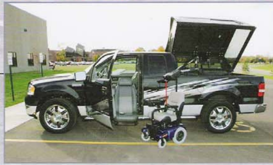
OUT-RIDER™ LIFT W/ POW'R TOPPER PACKAGE