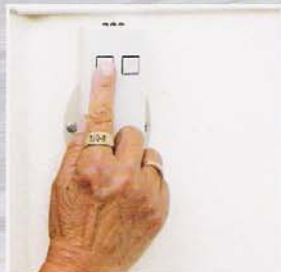
The two wireless call/send controls make the installation simple and clean with no wires running along the wall.

Easy on-and-off thanks to the Electra-Ride II's unique design.