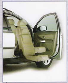
TURNY™ ORBIT® SEAT