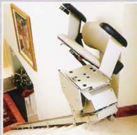
The arms, seat and footrest flip up, creating plenty of space for guests to walk up the stairs.