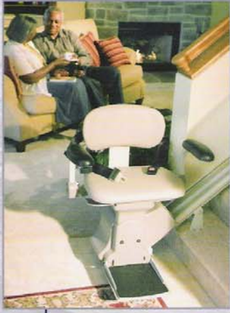
ELECTRA-RIDE LT™ Model SRE-2750