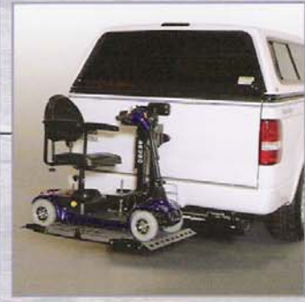
OUT-SIDER® MERIDIAN™ LIFT ASL-250