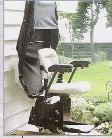
OUTDOOR ELECTRA-RIDE™ Model SRE-2000E The only 400 lb/ 181.8 kg capacity outdoor stairlift... an INDUSTRY EXCLUSIVE!