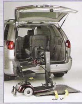
JOEY™ INTERIOR PLATFORM LIFT VSL-4000