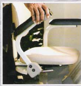
The arms flip up and out of the way for easy wheelchair transfer.

Using two 12-volt batteries that are continuously charged by an integrated battery charger plugged into a standard household outlet, the Electra-Ride LT features strip charge contacts for more flexibility when parking. You have access to your upstairs and downstairs, even if electrical service in your home is interrupted.