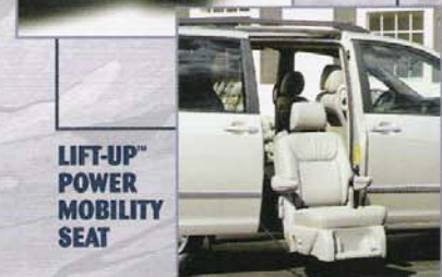
LIFT-UP™ POWER MOBILITY SEAT