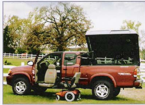
OUT-RIDER™ LIFT W/ POW'R TOPPER™ AND TURNY ORBIT PACKAGE