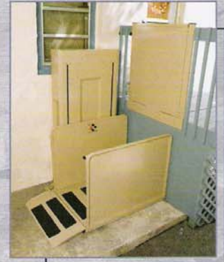
VERTICAL PLATFORM LIFT