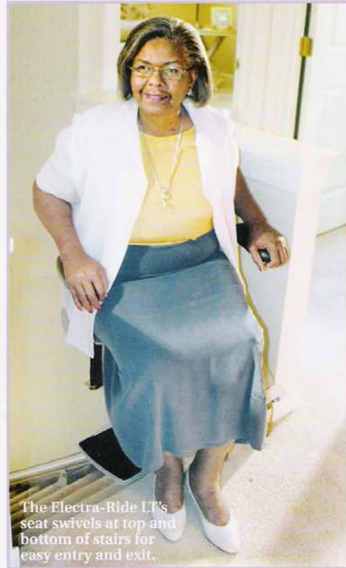
The Electra-Ride LT's seat swivels at top and bottom of stairs for easy entry and exit.