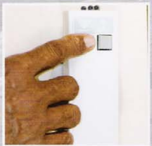
The two wireless call/send controls make installation simple and clean with no wires running along the wall.