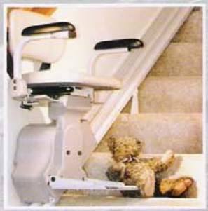
The footplate and carriage safety sensors safely stop you, even if the slightest obstacle is in the way while you ride!