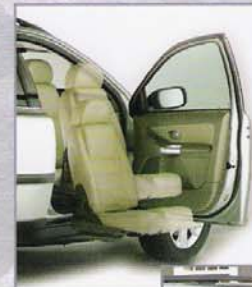
TURNY™ ORBIT SEAT