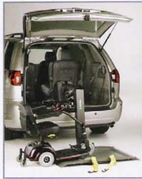
JOEY™ INTERIOR PLATFORM LIFT VSL-4000