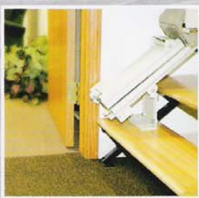
Folding rail option allows full clearance to doorways or hallways without rail obstruction.