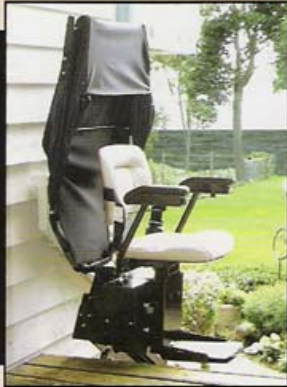
OUTDOOR ELECTRA-RIDE™ ELITE Model SRE-2000E

Home accessibility solutions and automotive products