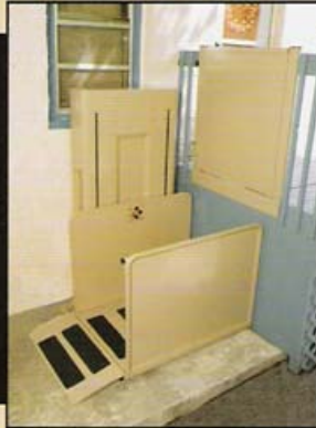
VERTICAL PLATFORM LIFT

The only 400 lb/181.8 kg capacity outdoor stairlift... an INDUSTRY EXCLUSIVE!