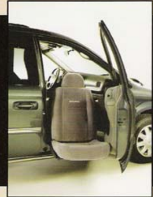
TURNING AUTOMOTIVE SEATING™ (TAS™)

Founded over 20 years ago, Bruno Independent Living Aids, Inc., is a world-wide manufacturer of accessibility products designed to enhance the lives of those challenged by limited mobility. In pursuing this goal, Bruno is proud to be the only U.S. manufacturer of indoor/outdoor stairlifts, interior/exterior scooter, powerchair and wheelchair vehicle lifts and Turning Automotive Seating™ (TAS™) products to be ISO 9001 Certified. This is one of the most stringent, widely-recognized quality standards in the world and your assurance that Bruno is committed to providing you with the highest-quality, most reliable products in the industry. Ask your certified Bruno dealer for details on all Bruno independence products.